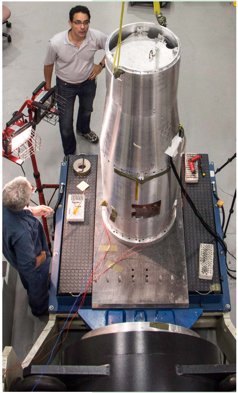
The Adiabatic Demagnetization Refrigerator (ADR) for the Micro–X mission at Wallops for vibration testing.