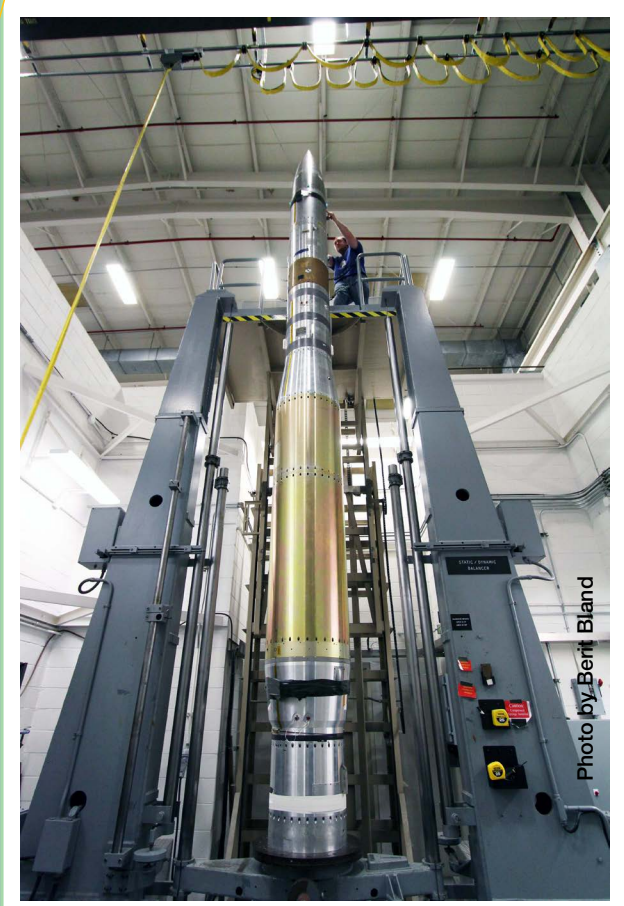
36.235 Harris on the balancing table at Wallops.

36.235 US Harris - HYPE was launched from White Sands Missile Range, NM on May 3, 2014.