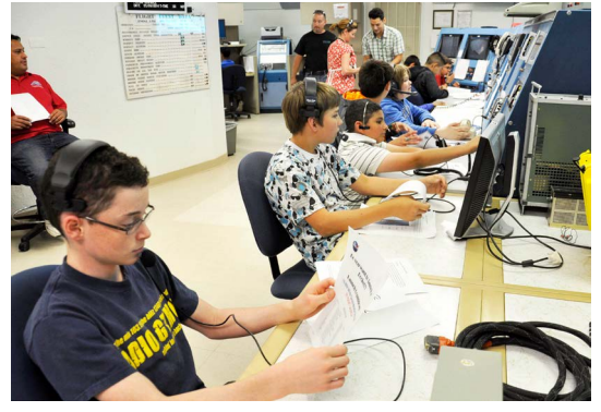
Students read the instructions before the simulated NASA launch as they become familiar with their stations in the control room.