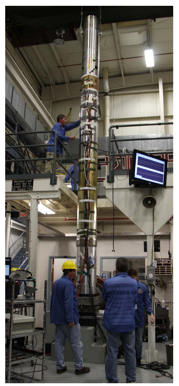
Images above were taken during integration activities at Wallops Flight Facility.