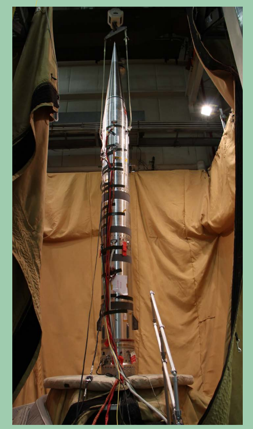
Sub-TEC in deployment bay at Wallops.