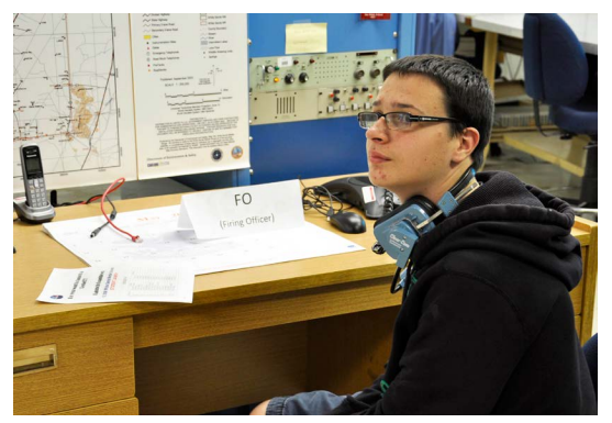
Each student is given a job title and a specific task during the simulated NASA mission.